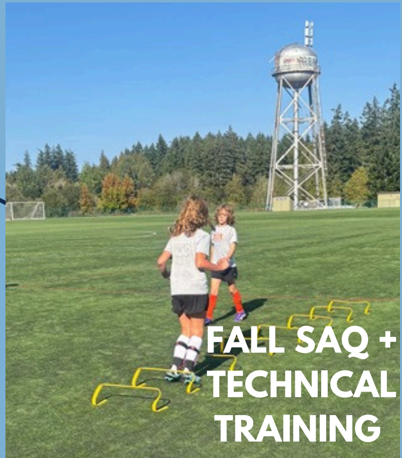
FALL SAQ + TECHNICAL TRAINING