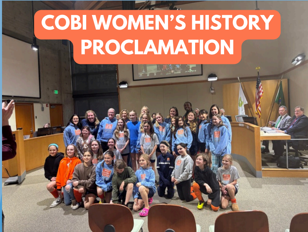
COBI WOMEN'S HISTORY PROCLAMATION