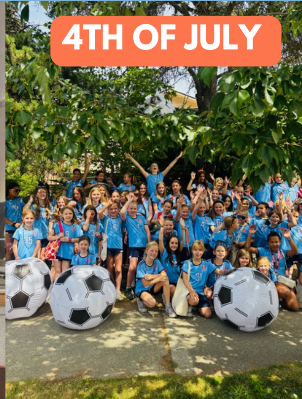
4TH OF JULY