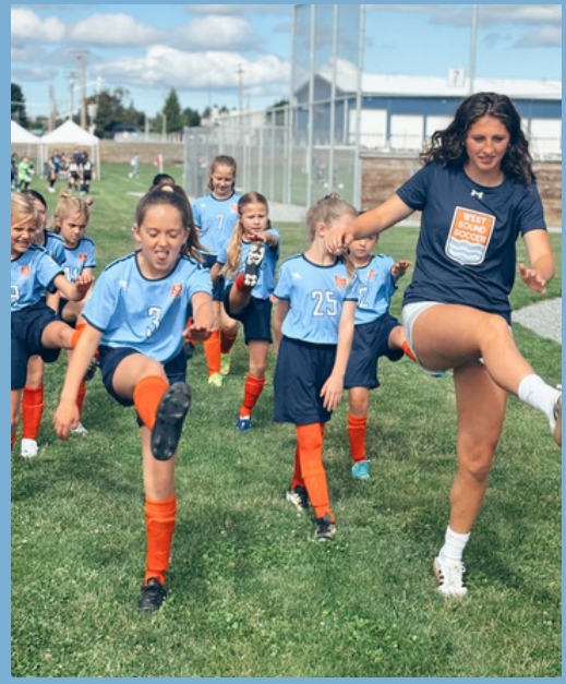
INJURY PREVENTION WARM-UP