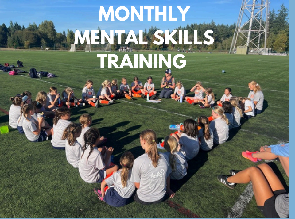
MONTHLY MENTAL SKILLS TRAINING