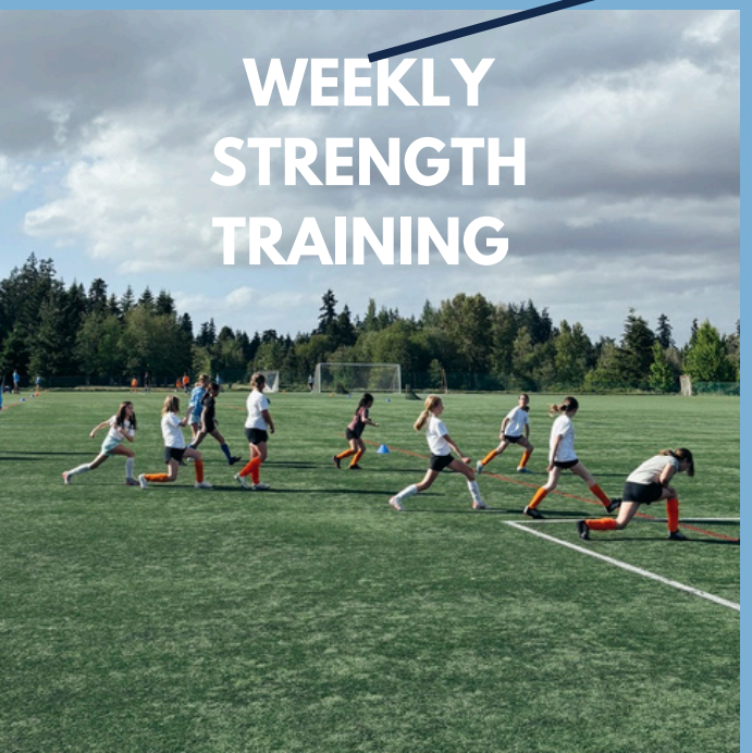
WEEKLY STRENGTH TRAINING