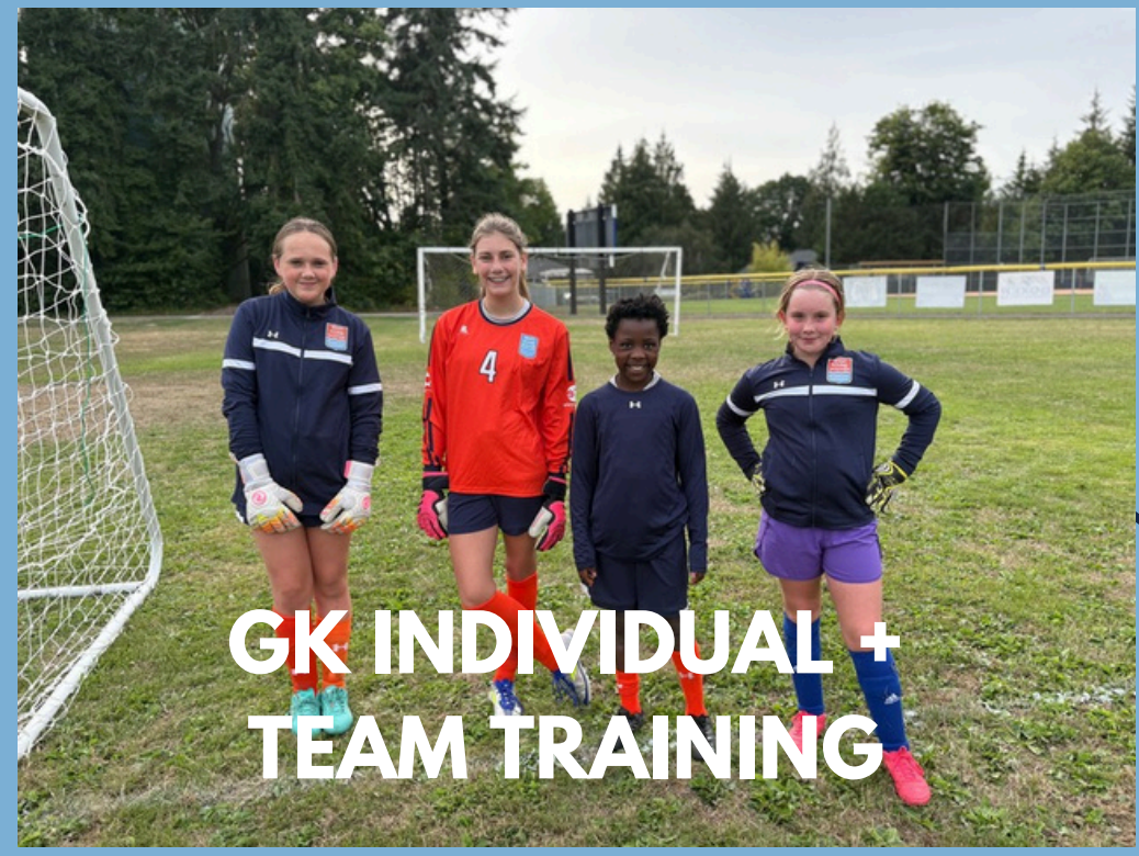
GK INDIVIDUAL + TEAM TRAINING